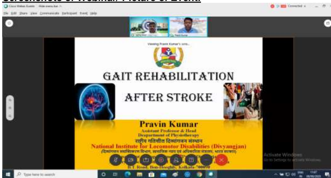
Fig 2: Introduction to Post Stroke Gait Rehabilitation

d) Screenshots of Webinar/ Picture of Event: