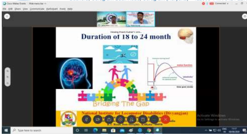
Fig 4: Expert elaborating about the golden period for the recovery and rehabilitation

Budhera, Gurugram-Badli Road, Gurugram (Haryana) – 122505 Ph. : 0124-2278183, 2278184, 2278185